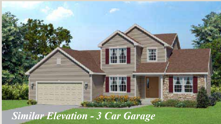
Similar Elevation - 3 Car Garage

2,211 sq. ft. Walk-out Lower Level W141 N10550 Wooded Hills Dr. (Lot 5) Hillside View | Germantown Move In Ready