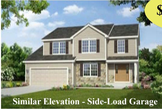
Similar Elevation - Side-Load Garage